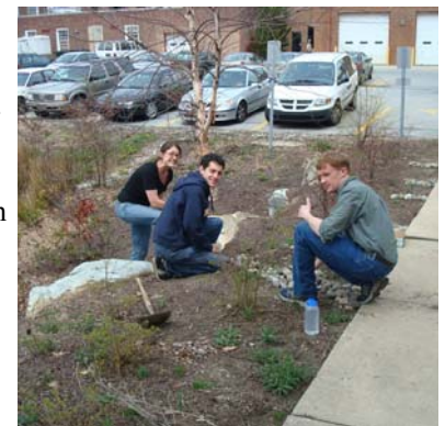
Members of the new Delaware Student Chapter of AWRA assist with the spring clean up at the University of Delaware, Water Resources Agency's rain garden.